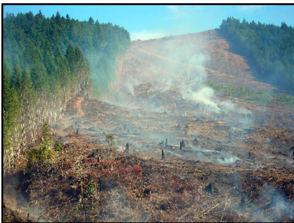
All red/black/purple areas on the map could end up looking like this clear cut.

*Map shows less than half of the Forest Service mandates for logging.