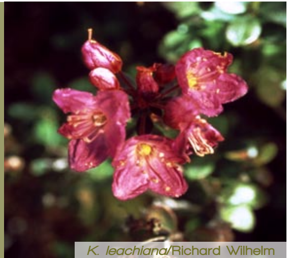
K. leachiana /Richard Wilhelm

The Siskiyou Wild Rivers area is threatened by over 100 miles of proposed ATV trails reaching deep into wildlife sanctuaries. In addition, California recently banned suction dredge mining, and many of those miners have set their sights on rivers in Oregon's Yellowstone. Wilderness and Wild & Scenic protections will help ensure these harmful activities won't mar this biological and scenic wonder.