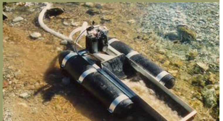
Suction dredge mining equipment like this pack vacuums river bottoms destroying salmon spawning habitat

Oregon's natural areas are an important part of why Oregon is a special place to live, work, and raise a family. The Siskiyou Wild Rivers region is Oregon's largest intact wilderness and is home to over 100 plant species found nowhere else in the world, including the carnivorous darlingtonia plant. Healthy, abundant salmon runs teem in the blue-green waters of the Illinois River and between the banks of the rushing Chetco River. The area also features Oregon's only Redwood forests, growing to a massive 15 feet in diameter. Additionally, these wildlands provide a key haven for wildlife as pressures from climate change and unchecked development mount.