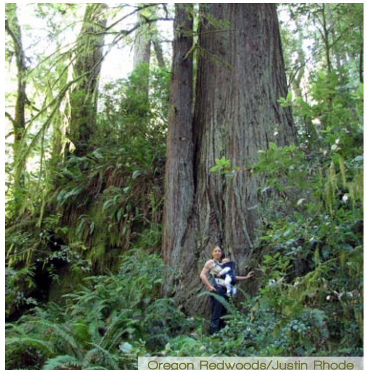
Oregon Redwoods/Justin Rhode