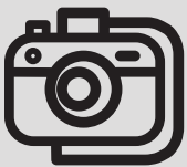
Photo Booth Sponsor $2,000

Who doesn't want to have their picture taken with the special guest of the evening, the Oregon Wild bear? Sponsor the Photo Booth and ensure that all those hundreds of selfies have your business name in them. Other benefits include: